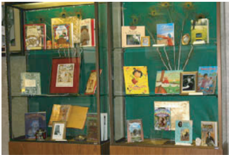
Speakers' books and pictures were displayed in the Henry Madden Library at Fresno State University for the October conference.